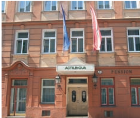
Newly renovated typical Viennese Art Nouveau building

You can reach the school and city centre in 10 to 15 minutes by public transport.