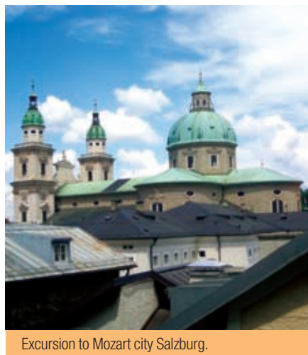
Excursion to Mozart city Salzburg.

The weekends are a time for culture and nature. We organize trips and excursions