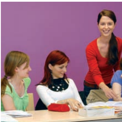
Motivated and qualified teachers.

Lessons: Teachers' Course Standard: 25 per week: Teachers' training course (20) + cultural programme (5) or Teachers' Course Intensive: 35 per week: Standard German course (20) +