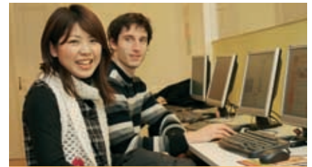
Free W-LAN/Wi-Fi in the whole school.

Combine a German course with a ski day on weekends. Request our detailed programme.