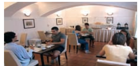
Breakfast buffet at the ActiLingua Residence.

Facilities: Single or Twin rooms. Most rooms include a shower, toilet and telephone.