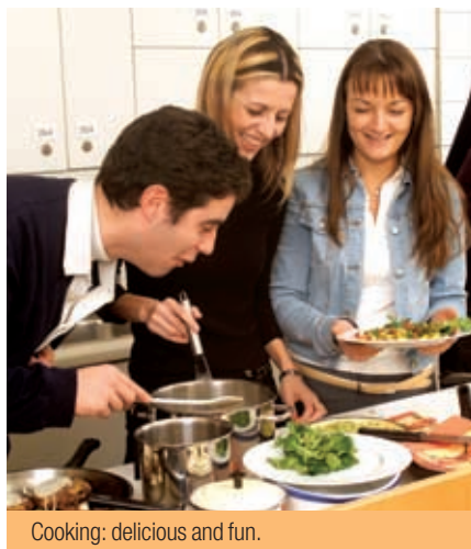
Cooking: delicious and fun.

Excursions are booked and paid for directly in Vienna (cost price).