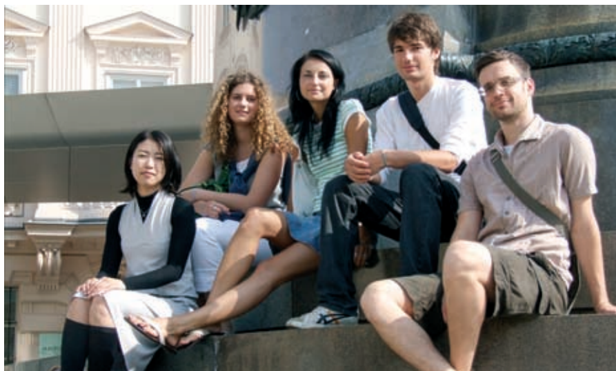
The current cultural and leisure programme is published weekly.