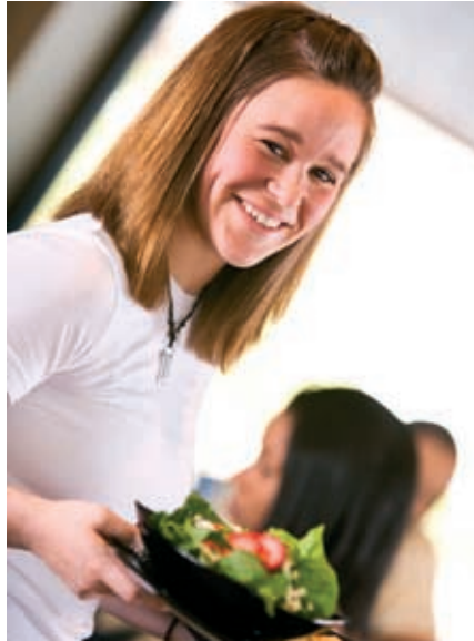
Work experience in a hotel.