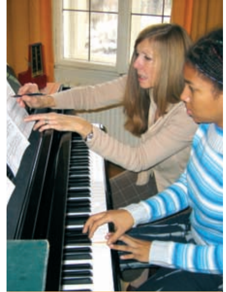
German and Music.

Teachers' training course (10) + cultural programme (5). Group size: 5–12.