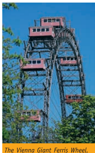
The Vienna Giant Ferris Wheel.